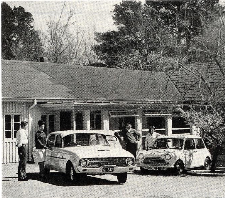
Narellan House, a low-tariff hostel within easy walking distance of the city's main shopping and entertainment area.

On completion of the movement of the Department of Air from Mel-