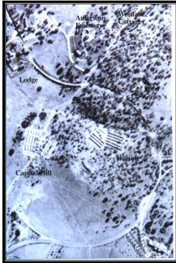
The above photograph of Capital Hill was taken in 1952.