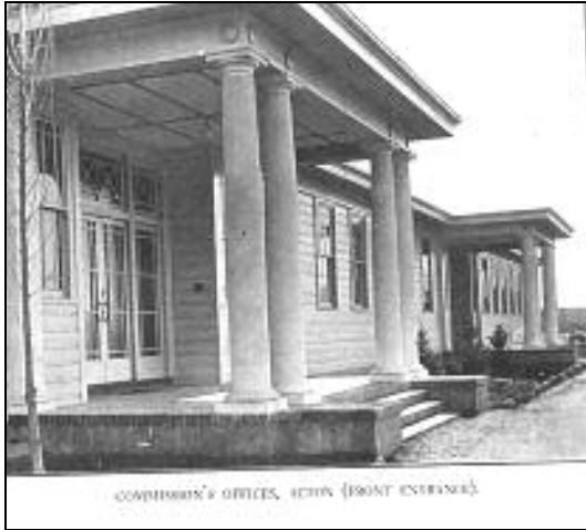
Below: Photograph of the FCC offices at Acton 1926.