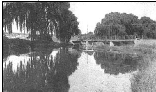
Above: Lennox Crossing in 1926