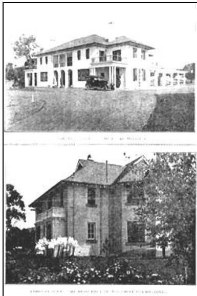
Frank Dunshea: The Commissioner's Residence [Canberra House]

Two photographs - top one is of the Prime Minister's Lodge and the bottom one of Canberra House, Acton 1927.