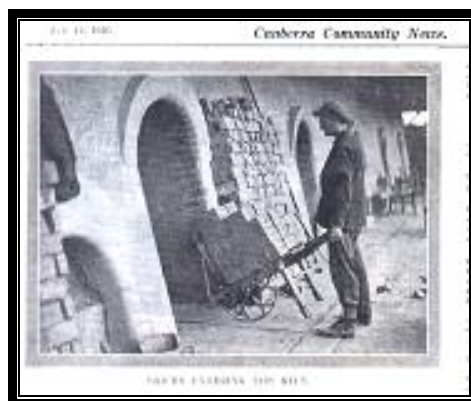
Page of Federal Capital Pioneer July, 1926