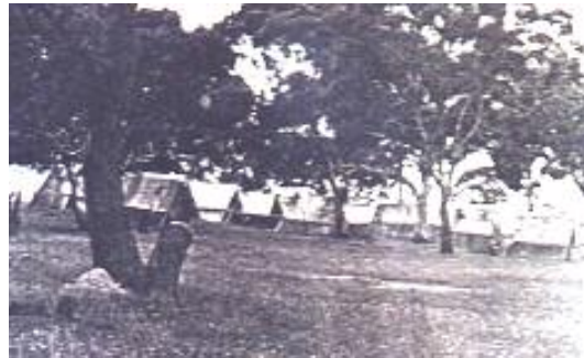
Red Hill Camp 1927.

The men from No 1 Labourers' Camp at Westlake moved to this camp in 1927. Some had Red Hill, Westlake after their names.