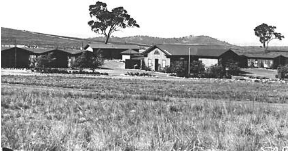
Above Capitol Hill Camp circa 1927 and below - Westlake, Red Hill Horse Camp 1927